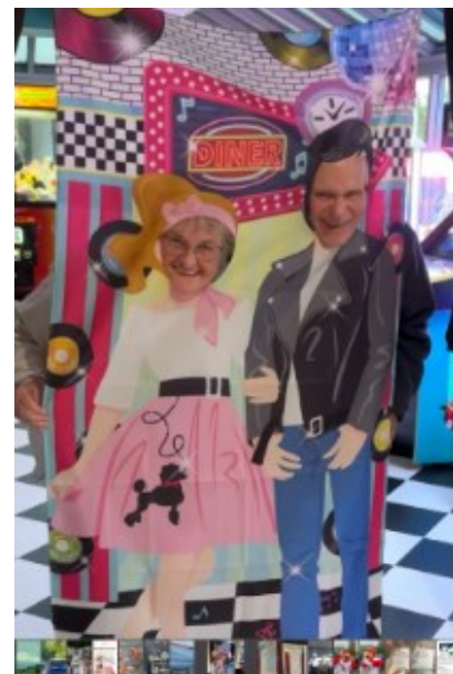
Redding Car Show 1955 Mercury