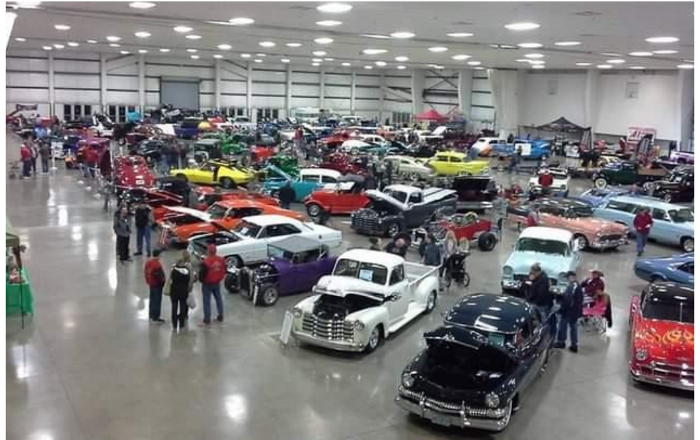
Winter Rod & Speed Show January 19-20, 2024