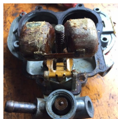
Webber Carb from an MGB after being parked for several years causing severe contamination in the fuel tank. Clogged needles and leaking brass float.