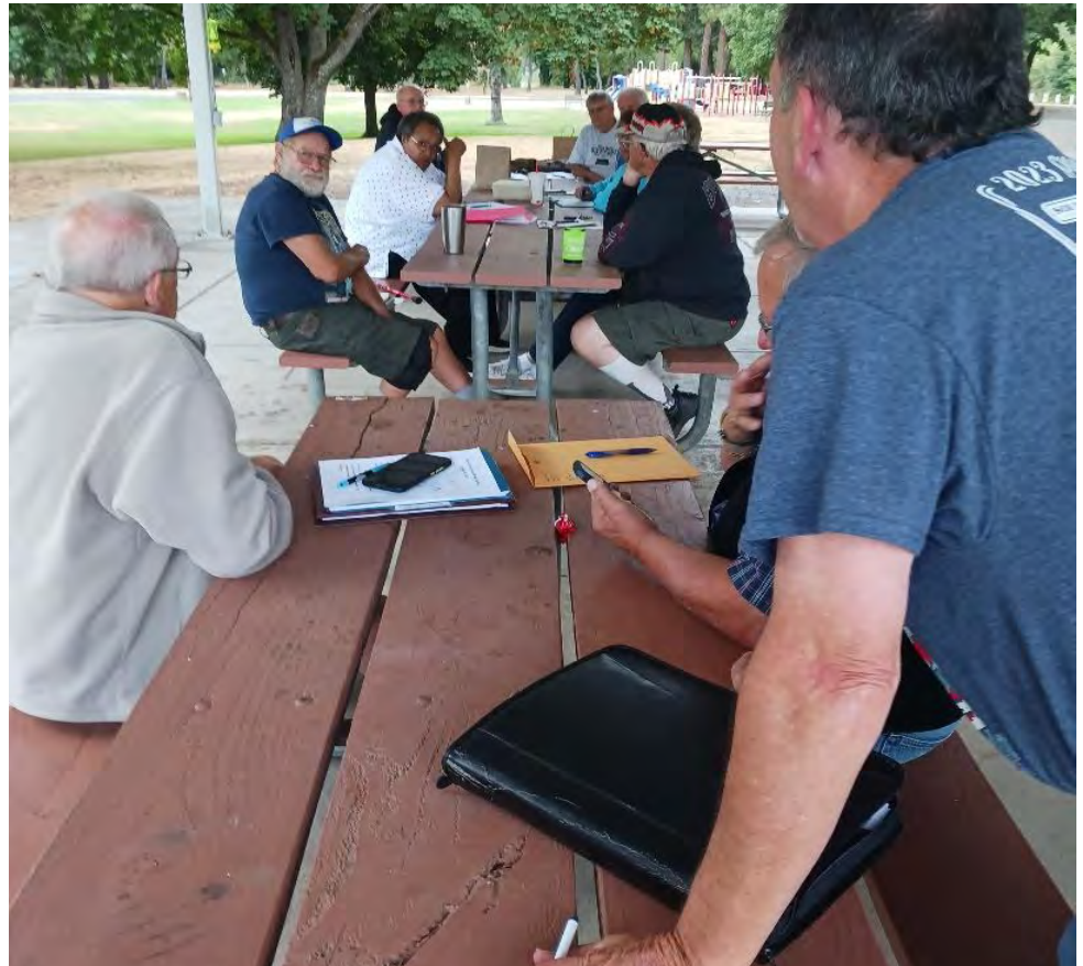
Board Members Planning a Car Show at River Park

Sept 24, 2023 Fish of Albany is having a Celebration to honor 50 years of service 1973-2023 2:00 pm to 5:00 pm Stop on and say hi! Refreshments