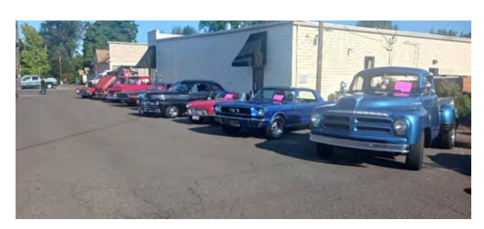
Jefferson Heroes parade and celebration. Rollin' Oldies had 11 cars

The Rollin' Oldies Car Club of Lebanon invite you to join us at the Thursday Night Cruise In at the Albany Grocery Outlet Store, 5pm-8pm. If you have a classic car or a special interest vehicle clean it up and bring it. Food Trucks and local donuts too! Always open to the public