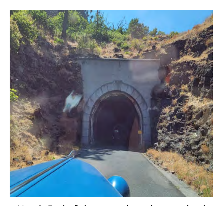
North End of the tunnel on the way back