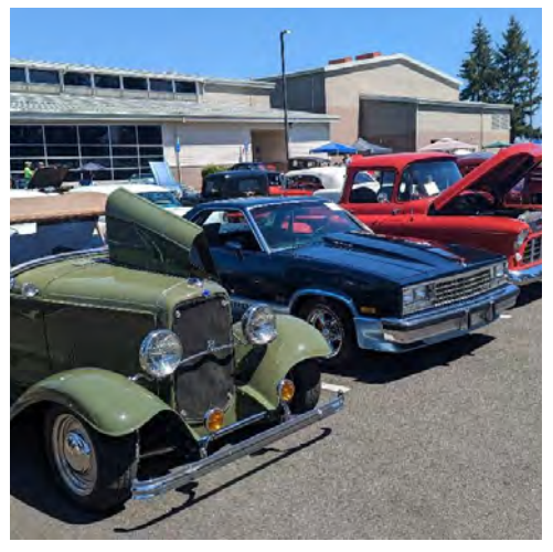
Turner Cascade Show