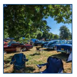
Springhill Car Show