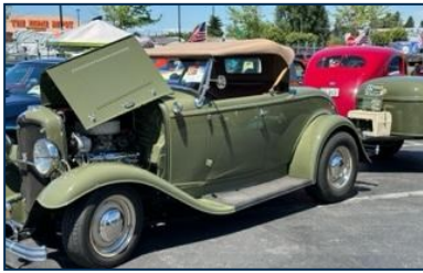
Paralyzed Veterans Show June 10