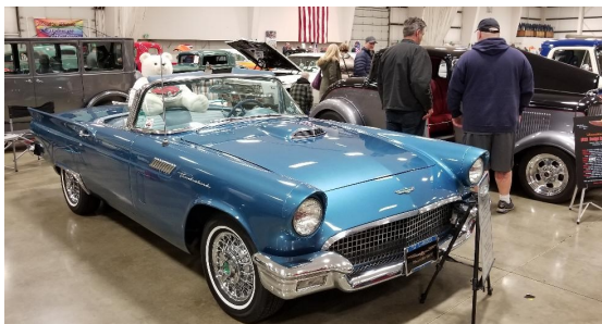
Car of the Month: 1957 T-Bird Convertible