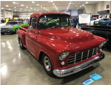
Bob Bilyeu Tangent, Or 1955 1/2 ton Chevy Pick-Up